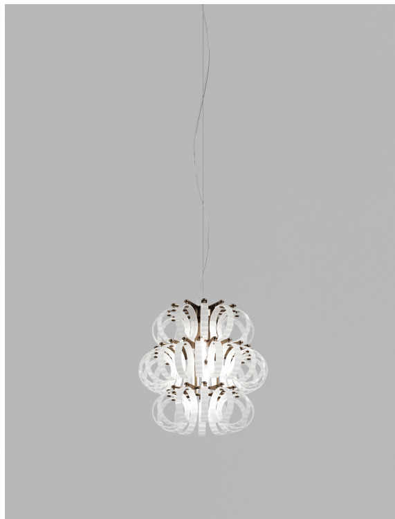
ECOS SP 35 BCRI BS E27 CE