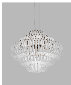
ECOS SP 90