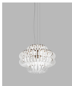
ECOS SP 60C